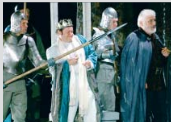
Mario Adorf, far right, dutching on a cigar!