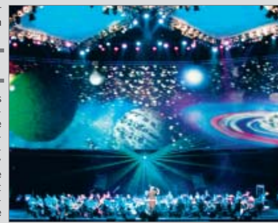
grandMA with the Sydney Symphony Orchestra

This is a definite plus when at high seas, for a trouble free operation is warranted in this particular case.