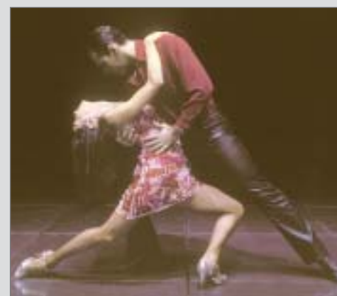
Tango at its best

and 40 artists dressed in more than 140 costumes, the different tango epochs illustrated the different tango epochs and what makes up the spirit of the tango: passion and melancholy, hope and disappointment, sensuality and control. Once again responsible for the remarkable lighting design in the