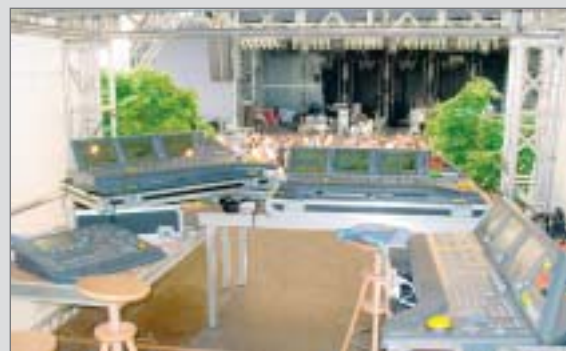
Front of house with grandMA's

year the spacious Museumsplatz turns into an atmospheric open-air theatre which attracts several hundred thousand people every year. The Museumsplatz itself