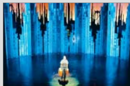
grandMA on Broadway