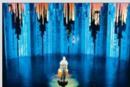
grandMA on Broadway

He will do his best to stand up for the grandMA in future projects. "The up-to-date features and the flexibility of the grandMA enable detailed and easy handled light shows, which integrate moving lights as well as conventional lights without problems. The console's reliability and operational simplicity are very impressive." Also this year's jury of the Tony Award was impressed and the new musical was awarded with 6 of the total 24 important prizes.