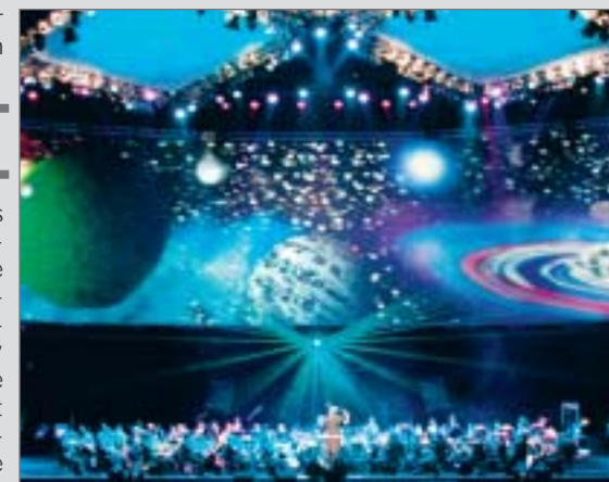
grandMA with the Sydney Symphony Orchestra

Although very little equipment was required, the grandMA light was chosen due to its capability to provide back up and its compatibility to serve as a main console. The grandMA light can serve as replacement should a problem develop with the theatre console. The light can easily read and control the corresponding shows. This is a definite plus when at high seas, for a trouble free operation is warranted in this particular case.