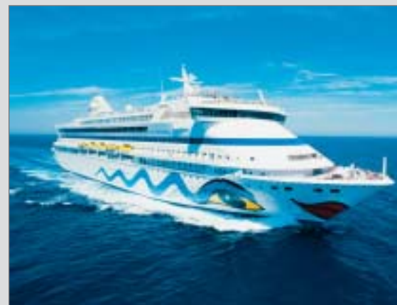
Club ship AIDAVita at high seas with two grandMA's on board